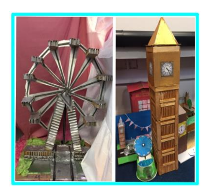
Easter Project sneak peak!

Our newest venture at St Mary's ...... our brand new Aquarium Watch this space for news of our new arrivals!