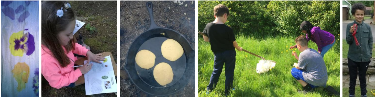
From left to right. Plant prints on a bandana. Leaf rubbings in the forest. Delicious pancakes cooked on the fire. Catching insects in a forest meadow. Learning the art of knot tying in true Ray Mears' style.