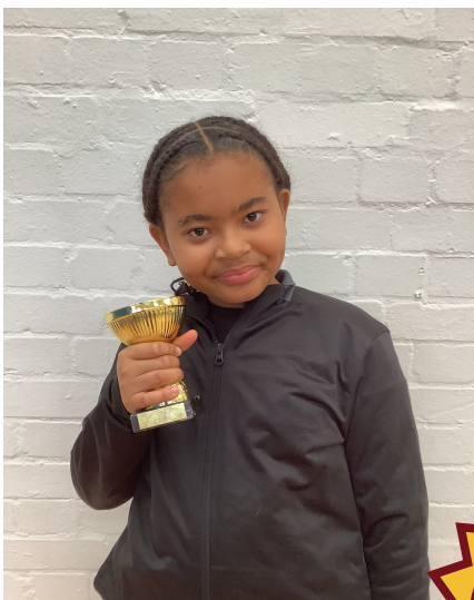
Lorrian KS2 Progress Star