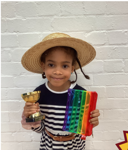
Isla KS1 Progress Star