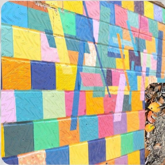
Dylan - Year 3

Following our extremely successful Creative Project for Young Transformers, please see below some of the submitted images. We are in awe of some of the amazing images that have been taken and produced!