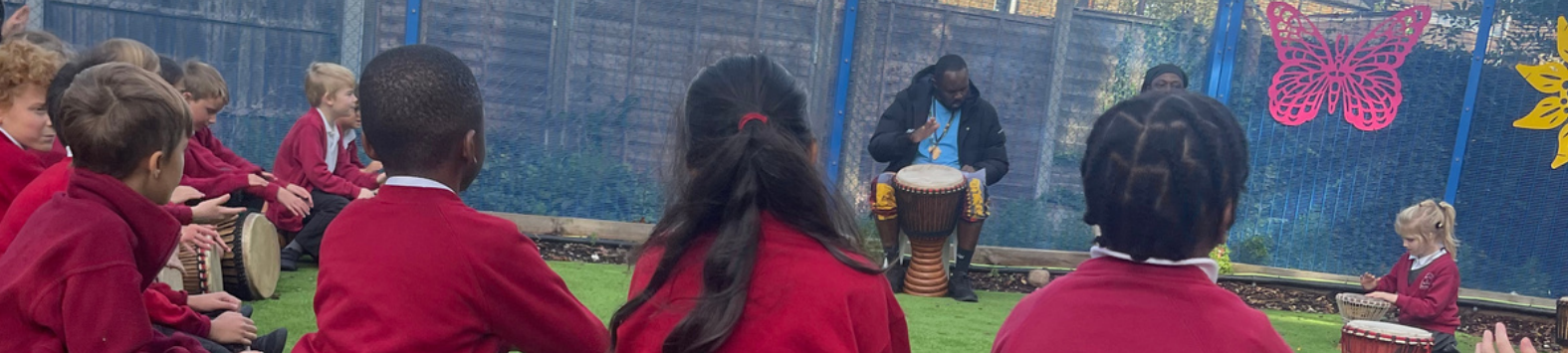
Dear Parents and Carers,

It is with a sense of great excitement that I write to you this week: the term has begun and we have our wonderful school back. Tirelessly, we worked over the summer holidays to prepare the school for the return of the children and seeing their faces on the first day of term certainly made it worthwhile. At Saint Mary's, we pride ourselves on our amazing learning environment - an environment which inspires and excites - and I am happy to be able to share with you some photographs of the displays which adorn the walls of our corridors. They truly make every journey around Saint Mary's an inspirational one.